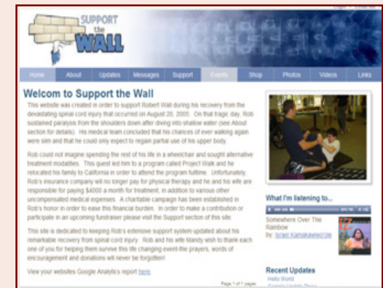
A Care Code website in action.

Applications for both Care Code programs are available on our website www.carecode.org and are only accepted online.